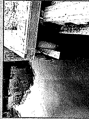
Raise Bulkhead Heights