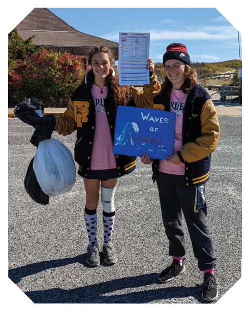
This dynamic sister duo make waves as they collect trash and data